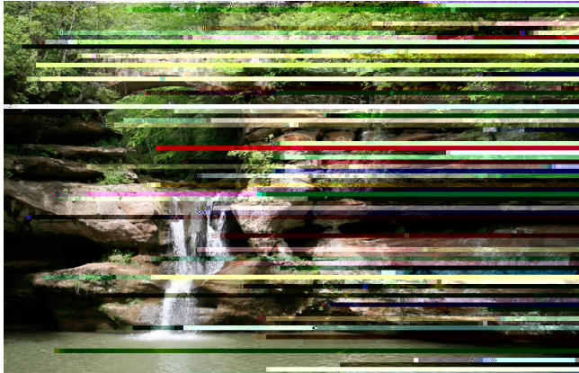
Spectacular natural amenities and a fordable cost of living attract both residents and businesses to south-eastern Ohio.

at Ohio’s Electric Cooperatives’ Economic Development. The sites that continue to hold our attention are those with an experienced workforce and a desirable quality of life.”